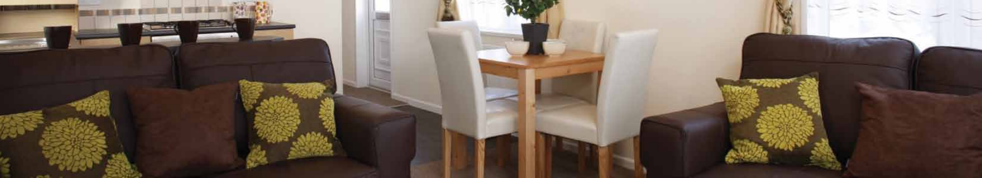
Thorverton Single internal layout