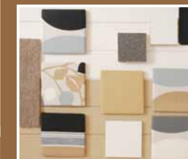
Thorverton Single Scheme 1