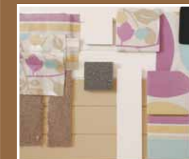
Thorverton Single Scheme 2