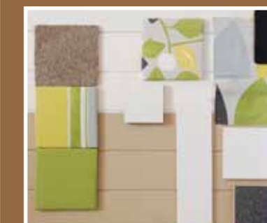
Thorverton Single Scheme 3